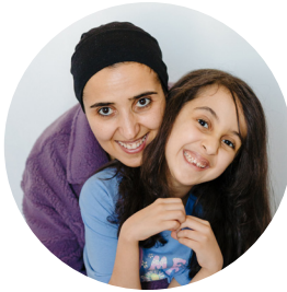
Caregiver or family member to a person with a neuromuscular disorder