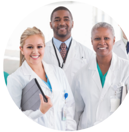
Healthcare provider to people with neuromuscular disorders