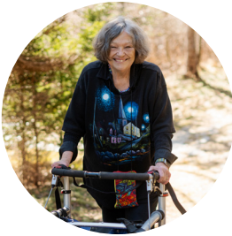
Person with a neuromuscular disorder